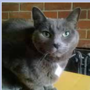
Cloudy - Jan. 2018