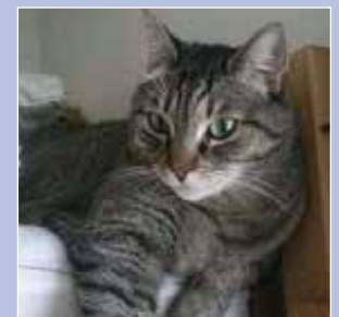
Lola - Nov. 2017