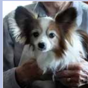
Middy - May 2017