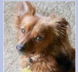
Ziggy May 2017

Every companion animal that passes through CIW's doors lives on in our hearts.