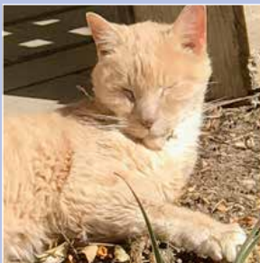
Boomer - Jul. 2017