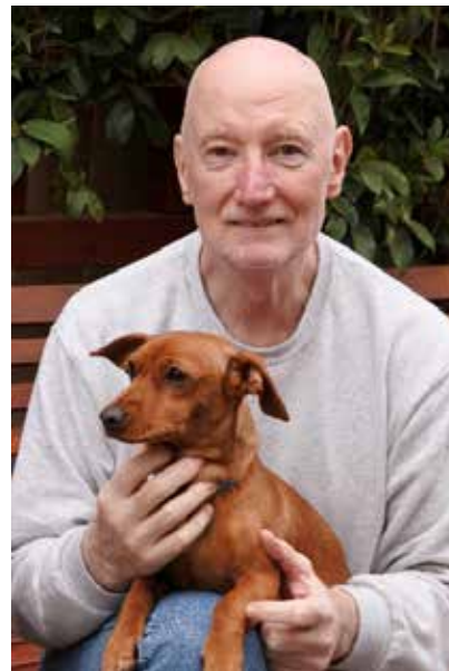
Cookie's Dad made a Plan B!

We rescued indoor cats who were put outside when their owners passed away or moved,