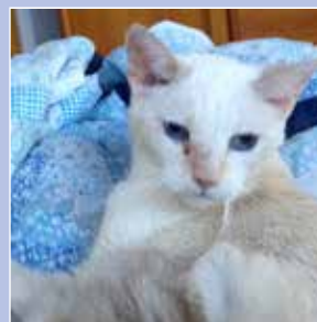
Celine - Aug. 2017