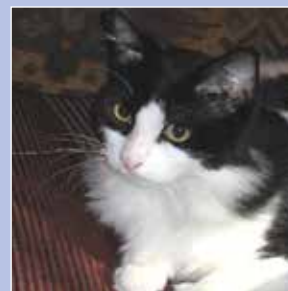
Popo - Nov. 2017